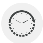
30 Days Recording

Monitor Console's advanced NVR platform simplify project management. Easy access 2K footage from multiple cameras with a few clicks.