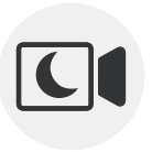
Color Night Vision