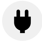
Plug & Play