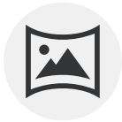
110° Ultra Wide

With full-color night vision and auto-defog sensor, HerculesPro captures detailed video in any light condition, ensuring smooth and secure operations at all times.