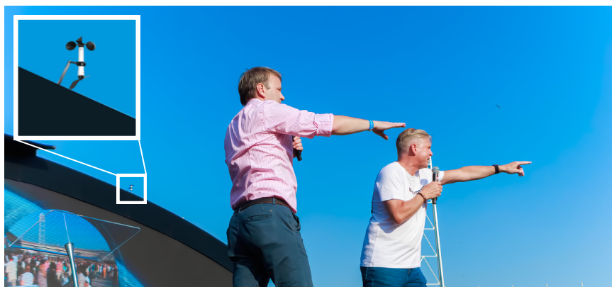
▲ The placement of wind speed & direction sensor on the stage

Fons utilized two wind speed and direction sensors at separate locations, both connected to WindPro. He explained, "We've placed tents and structures inside and outside the stadium so we had to measure (wind) at different locations." At the same time, WindPro displayed data from both locations, allowing all safety personnel to monitor wind conditions from the control room.